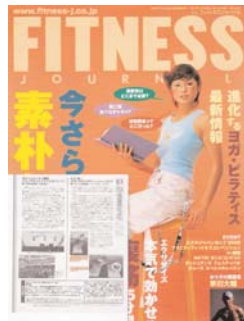
vinyasaBrasil™ featured as new trend