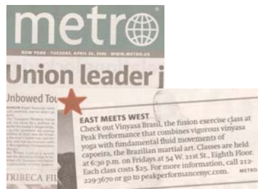
vinyasaBrasil™ featured as new fusion yoga class