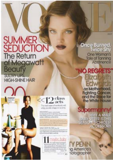
bodyBrasil™ featured as new trend class