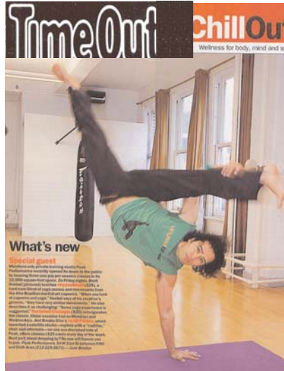
vinyasaBrasil™ fusion yoga class featured as new trend