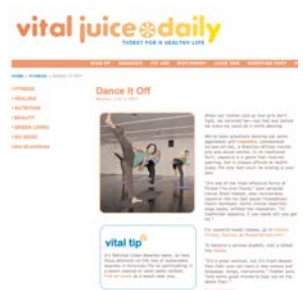
fitnessBrasil™ featured for incorporating capoeira