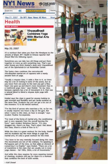
vinyasaBrasil™ featured as a new workout